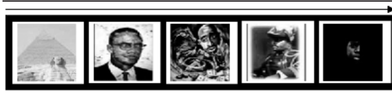
Figure 3. The Opening Sequence of Lyfe-N-Rhyme