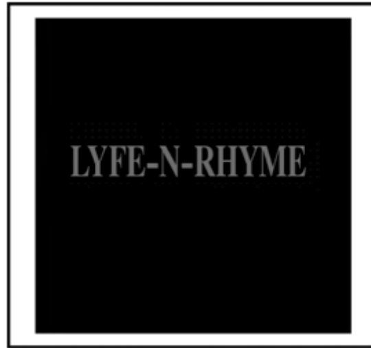
Figure 2. Title Frame

spelling out "Lyfe-N-Rhyme" in all capitals (see Figure 2). The contrast of blood red on black is startling; and also striking is the juxtaposition of the perhaps most institutional of font styles, Times New Roman, with radically unconventional orthography. In these contrasts, an intangible tension seems to be set up from the beginning. No words are yet spoken. All we hear as we take in the title are the tones of three simple keyboard chords that overlap slightly at their edges.